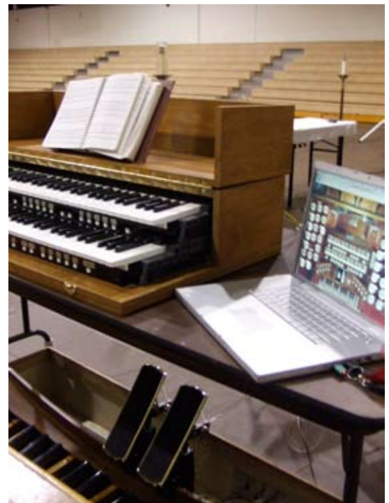
A view from the right side of the console. You can clearly see the “console” image on the laptop computer screen.

ing the next generation of electronic digital organs and voice expanders for both classical organs and theatre organs.”