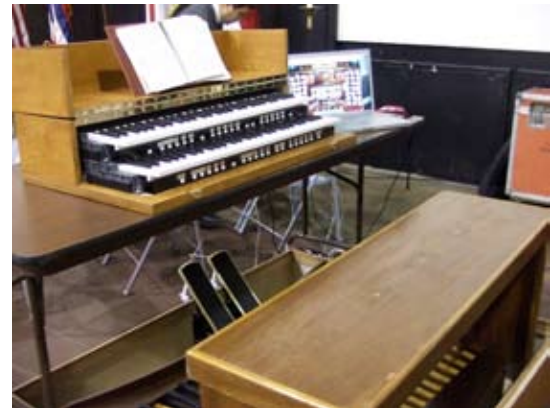
A view of the Virtual organ from the left side of the console. You can see the computer screen near the top of the photo.

“the pioneering virtual organ system that can bring the experience and sound of playing any pipe organ from anywhere in the world within the reach of almost anyone with a home computer and MIDI keyboard or MIDI sequencer, with incredible realism down to every last acoustic nuance and functional detail, whilst also power-