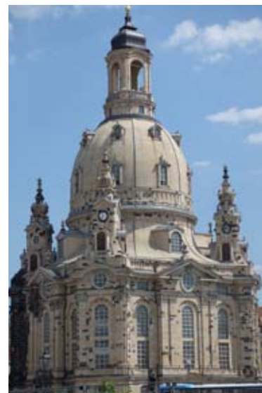
The Frauenkirche in Dresden, destroyed by Allied bombing during World War II, was only rebuilt in 2005.