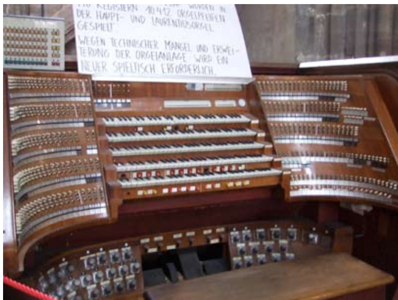
An organ console, free for the asking, from St. Lorenz, Nürnberg.