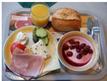
A typical German breakfast.