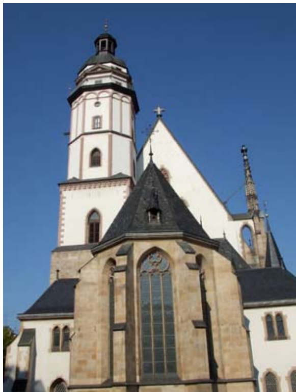
St. Thomas Church, Leipzig, where Bach worked as a church musician for 27 years.