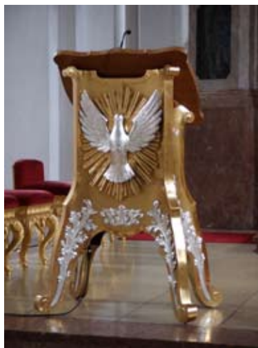
Lectern in St. Peter's, Mnich.