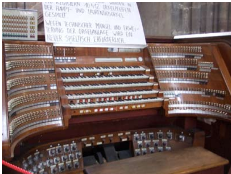
An organ console, free for the asking, from St. Lorenz, Nürnberg.