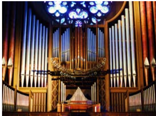
Organ façade at the First Congregational Church.