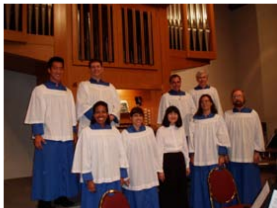
The Bach Chamber Choir