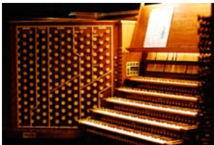
The console of First Congregational Church in Los Angeles, the largest church organ in the U.S. It was one of many organs that POE students visited and were able to play.