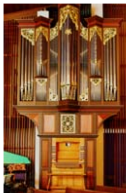
Tracker organ at All Souls

Program will follow in the church Lutheran Church of Honolulu 1730 Punahou Street Honolulu