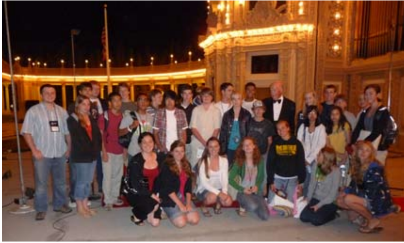
San Diego POE participants at the Spreckels Organ Pavilion.