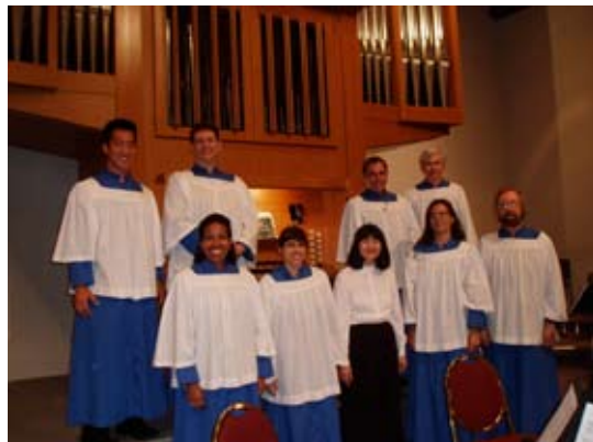
The Bach Chamber Choir