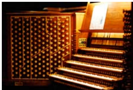
The console of First Congregational Church in Los Angeles, the largest church organ in the U.S. It was one of many organs that POE students visited and were able to play.